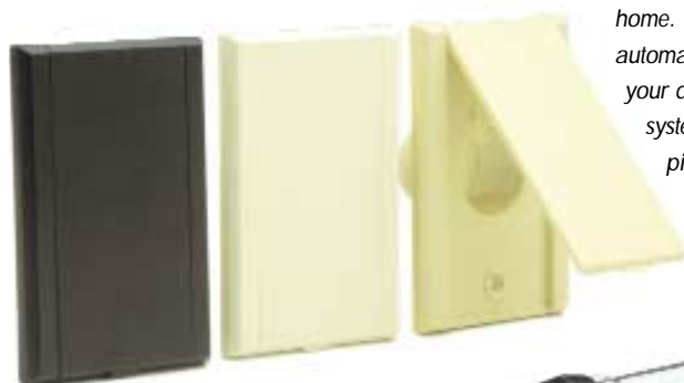
Ducted Vacuum Inlets

The DAS Ducted Vacuum comes with the highest quality accessories to maximise the cleaning performance of your system. A choice of attachments ensure that every tool you require to keep your home clean and healthy is available.