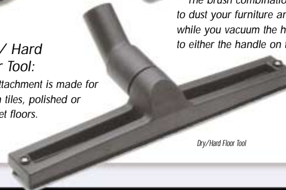
Dry/Hard Floor Tool

This attachment is made for use on tiles, polished or parquet floors.