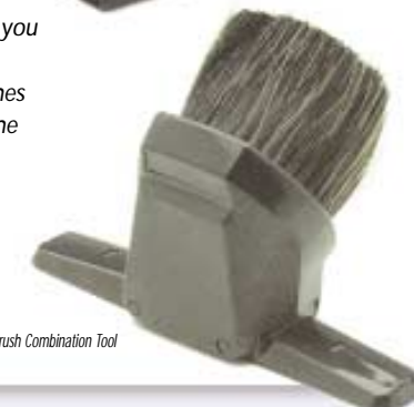
Brush Combination Tool

The brush combination tool allows you to dust your furniture and upholstery while you vacuum the house. It attaches to either the handle on the hose, or the telescopic rod.