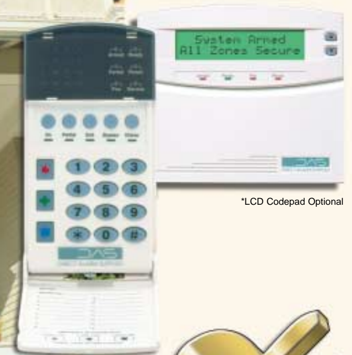
*LCD Codepad Optional