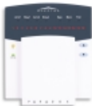
LED Keypad (1689)