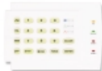
LED Keypad (1686H)