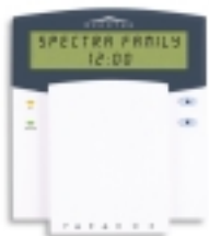
LCD Keypad (1641)

Spectra is as functional as it is attractive. It simplifies security so that you never have to struggle with your system. One-touch access keys and easy-to-read displays make all of Spectra's advanced keypads very user-friendly. Whether you require an LCD keypad or one of three LED models, Spectra has the right keypad for your home or office. Their stylish designs will enhance any decor.