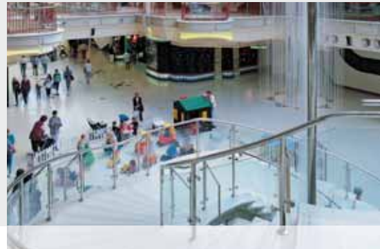
▲ Oversee shoppers in a mall