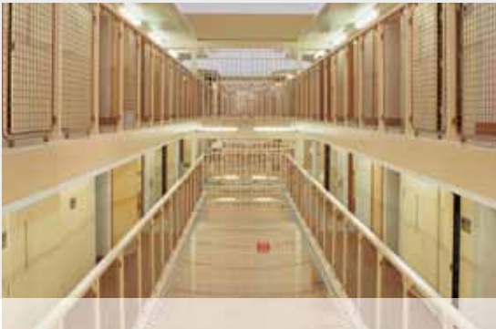
▲ Monitor guards and inmates

Installation is quick and easy, thanks to the fully integrated system design and wide-range power supply. Flexible configuration allows the camera to be matched to specific surveillance requirements without complex, time-consuming set-up procedures. Quick connection is ensured by screw terminals for power and a standard BNC video connector.